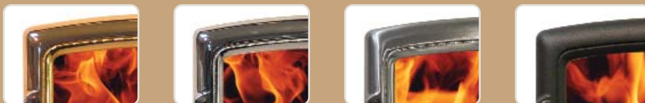
Arched Doors are available in Gold, Nickel, Brushed Nickel or Metallic Black.

Did you know that up to 80% of the heat from your open fireplace goes straight up your chimney? Pacific Energy's Summit Insert, the only insert with patented Extended Burn Technology gives you up to ten hours of burn for a full night of heat. The Summit Insert's extremely efficient Heat Extraction System transfers the maximum amount of heat to your room, over the longest time. And unlike an open fire, you control the heat output. A one-touch control quickly adjusts the heat to your desired comfort level.