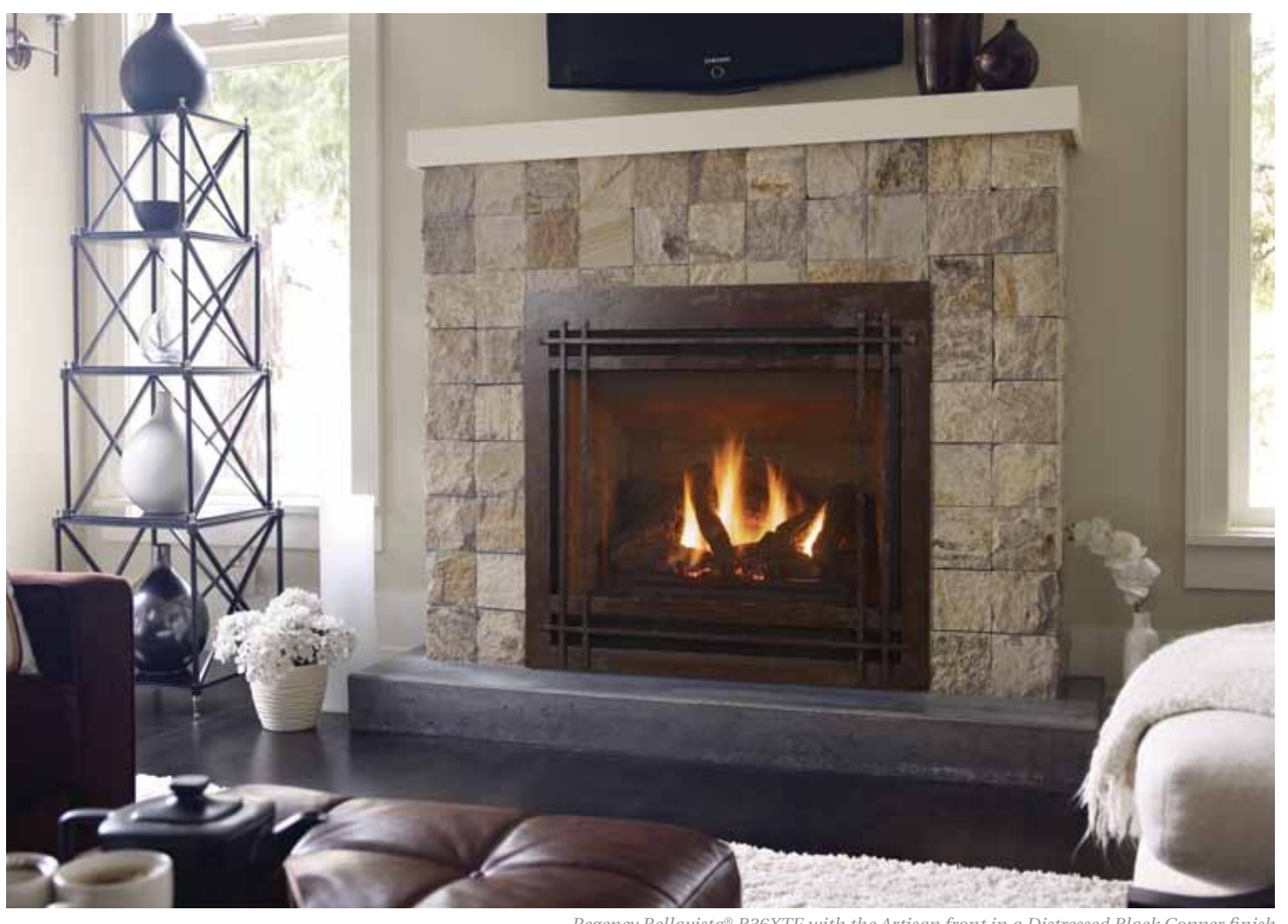
Regency Bellavista® B36XTE with the Artisan front in a Distressed Black Copper finish