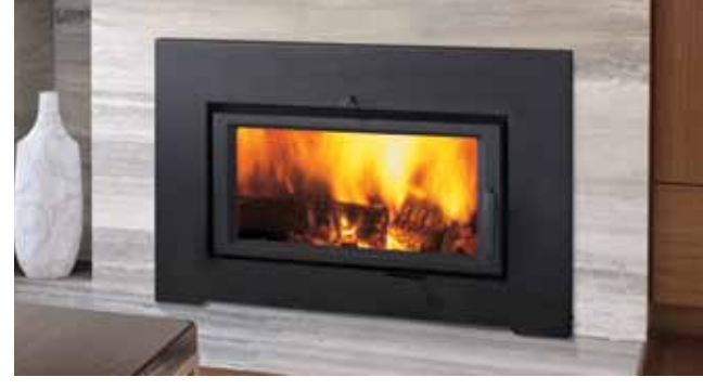
Regency CI2600 shown with low-profile faceplate