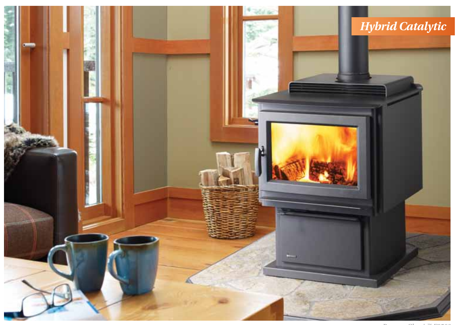
Regency Classic<sup>™</sup> F3500