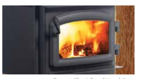
Regency Classic<sup>™</sup> traditional door