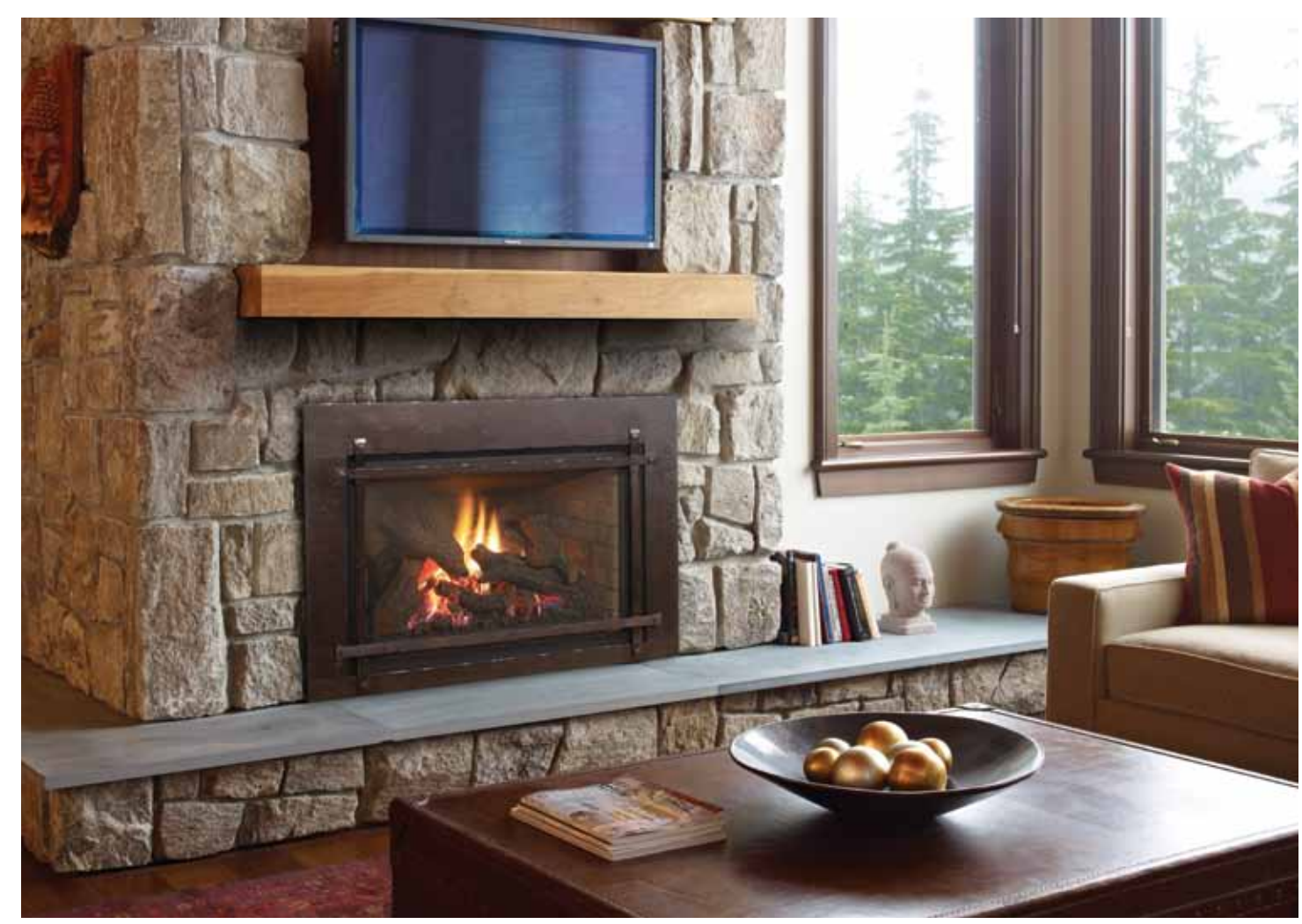
Regency Liberty® L540EB with the Artisan front in a Distressed Black Copper finish

Introducing Regency's new Artisan Styled Fronts.