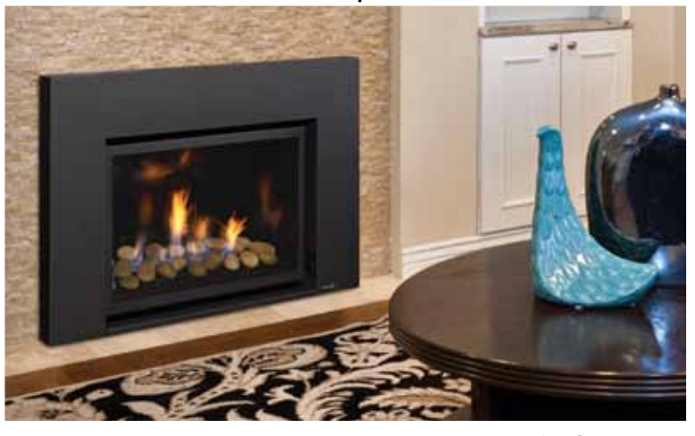
Regency Horizon® HZI540PB