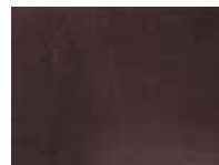
Burnished Black Copper