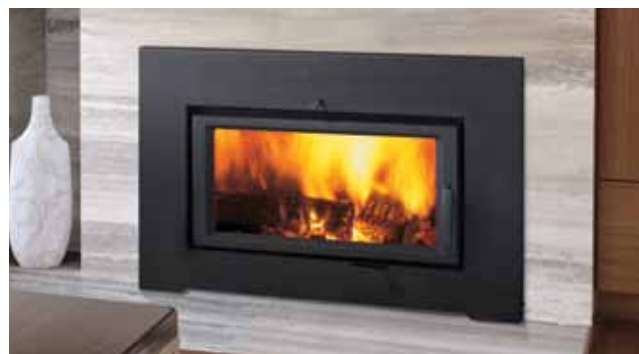
Regency CI2600 shown with low-profile faceplate