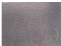
Burnished Buff Pewter