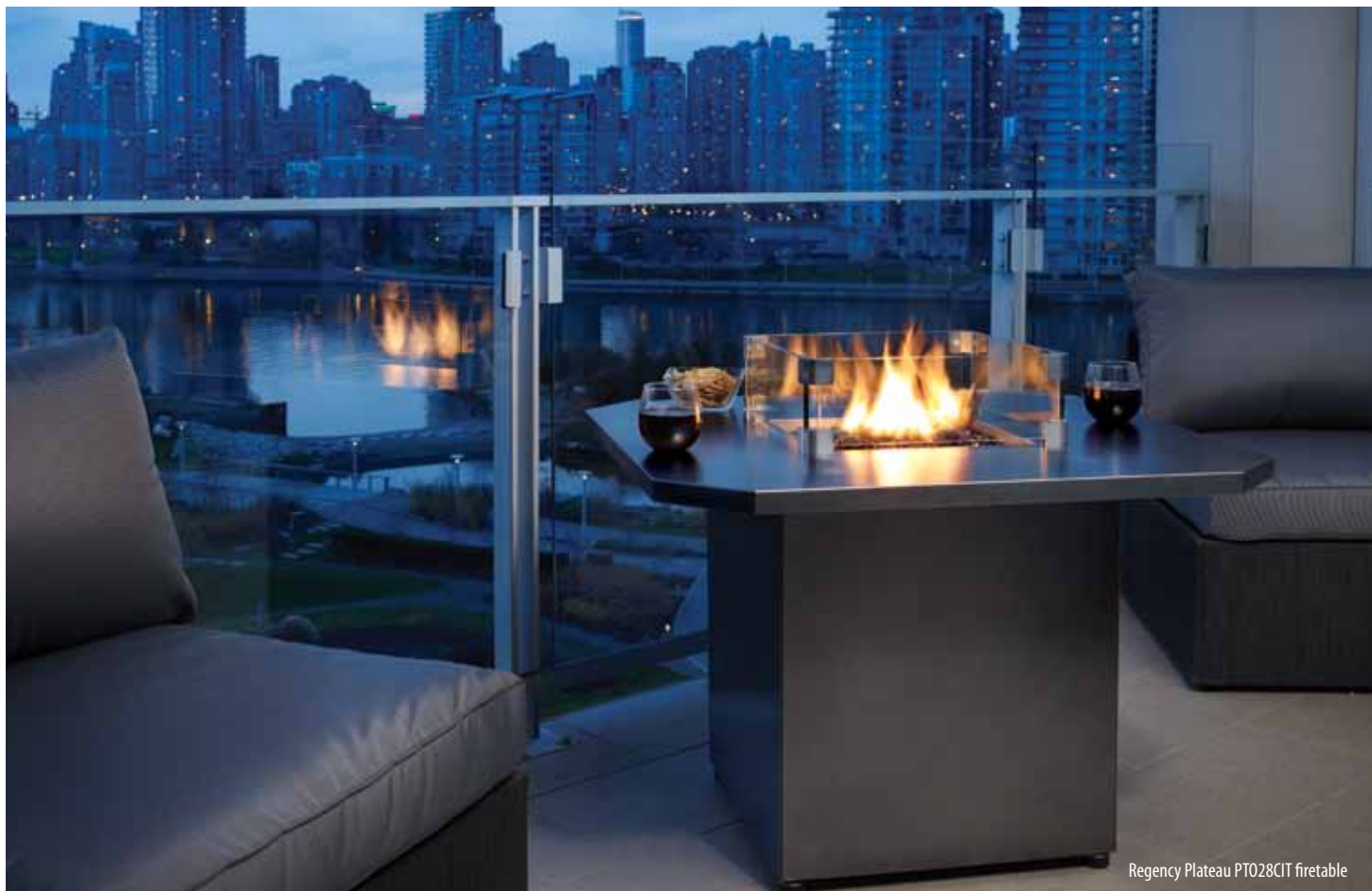
Regency Plateau PTO28CIT firetable