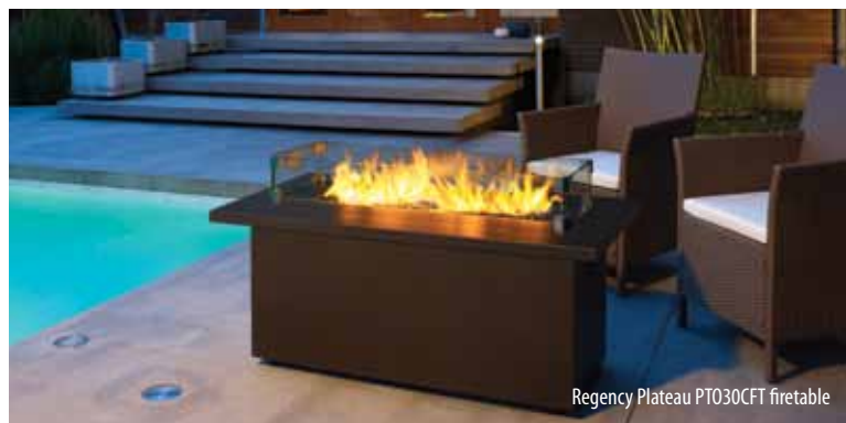
Regency Plateau PTO30CFT firetable