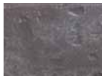
Distressed Buff Pewter