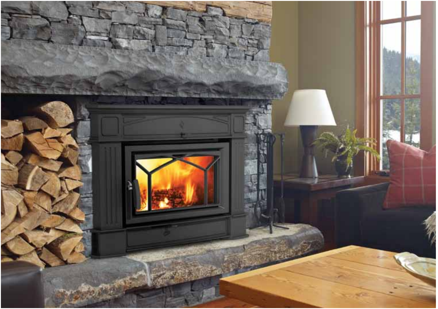
Hampton HI400 shown with the metallic black faceplate and optional decorative grille

Style meets Technology– Introducing Regency's new Large Hybrid Catalytic wood inserts.