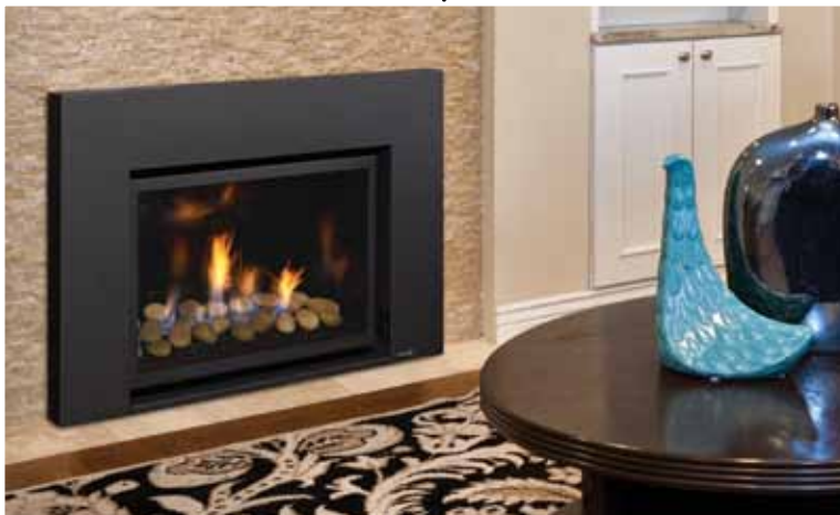
Regency Horizon® HZI540PB