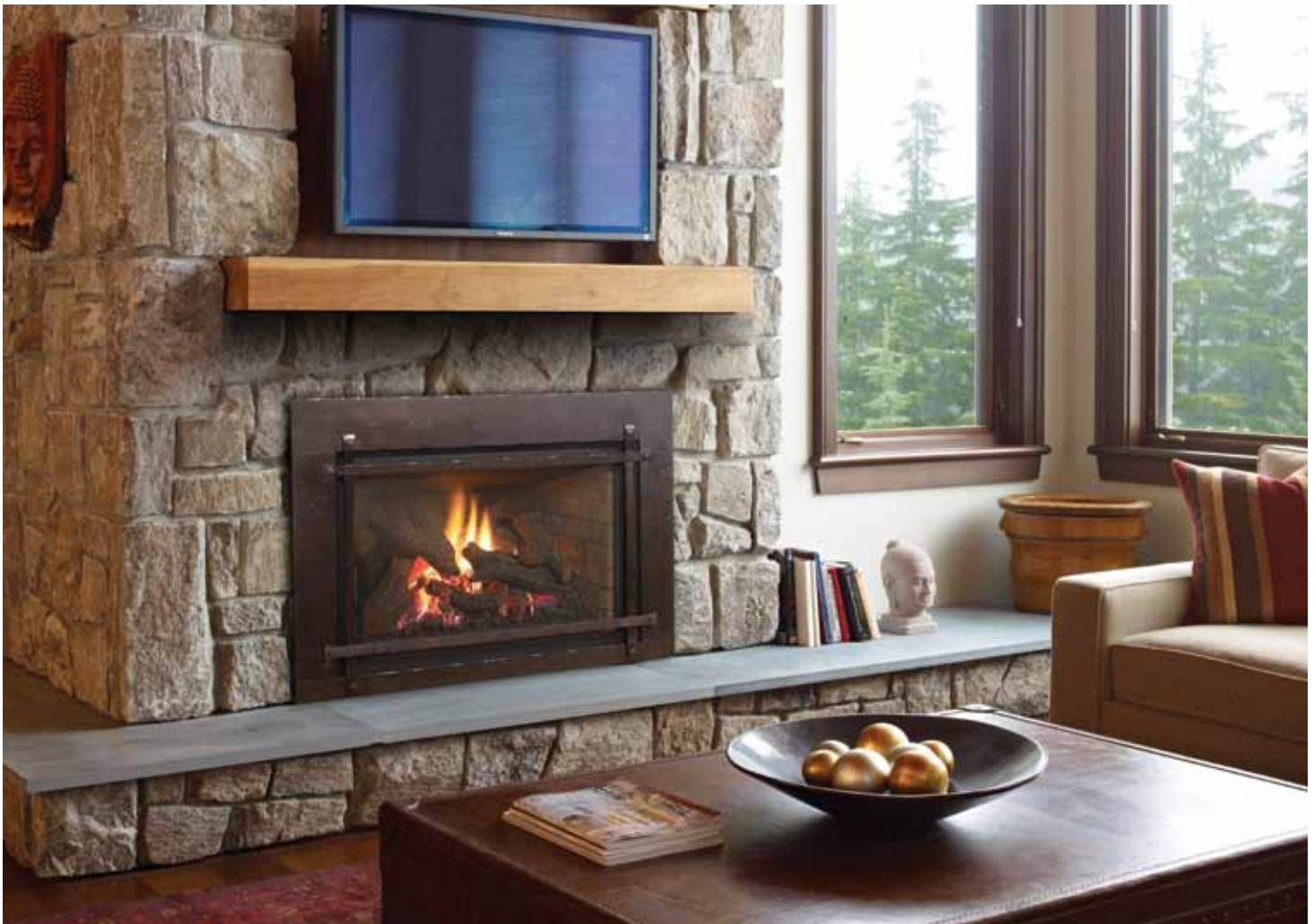
Regency Liberty® L540EB with the Artisan front in a Distressed Black Copper finish

Introducing Regency's new Artisan Styled Fronts.