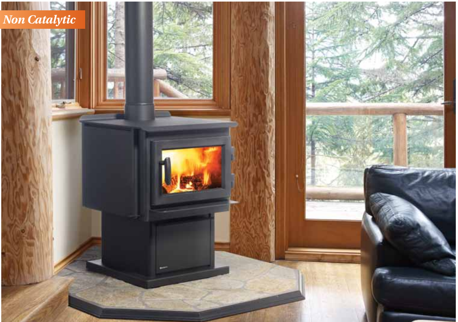
Regency Classic™ F2400 with the new contemporary door and pedestal

Regency's Classic wood stove line gets a face lift!