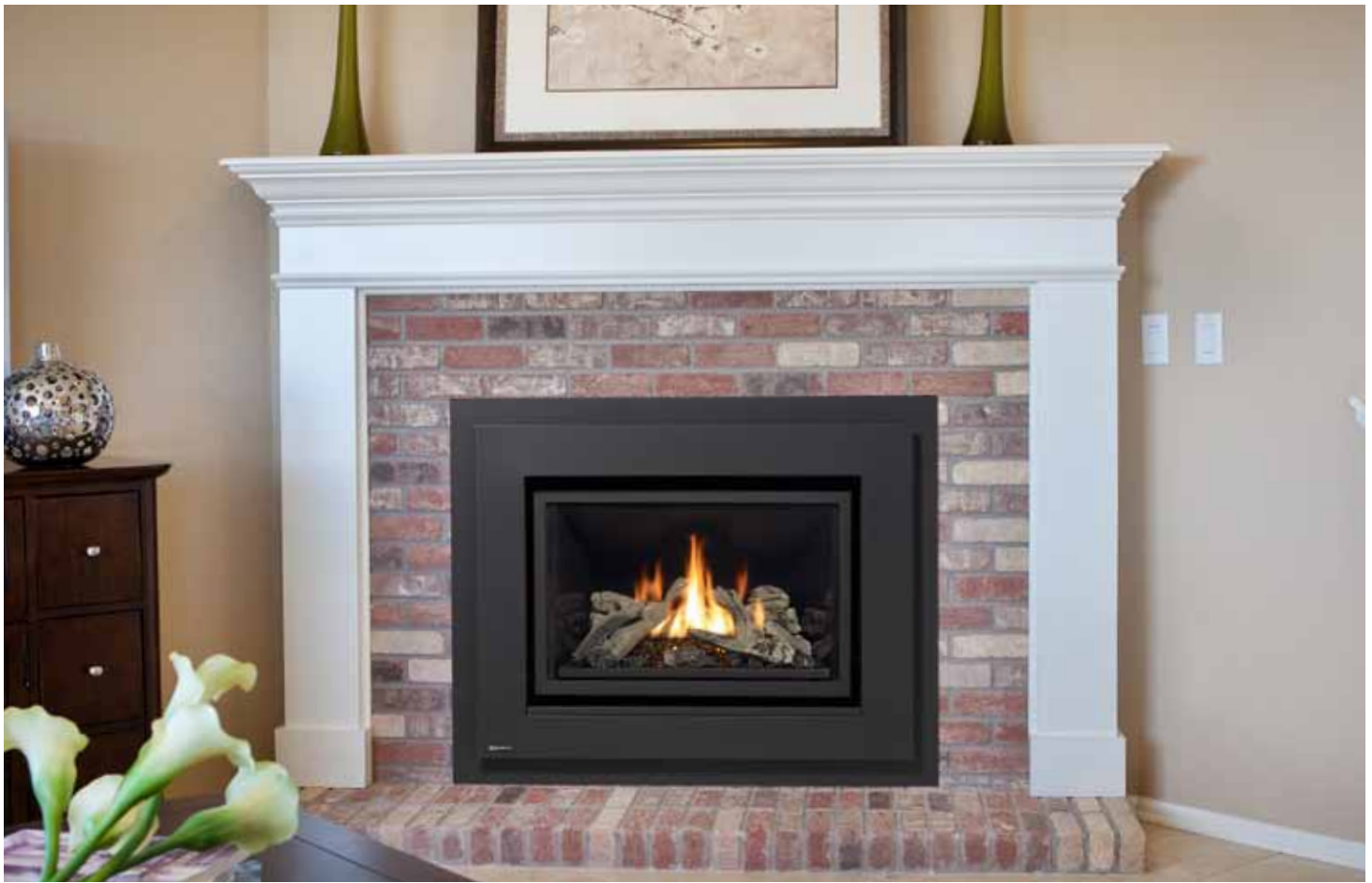
Regency Horizon® HZI390EB featuring the new driftwood log set