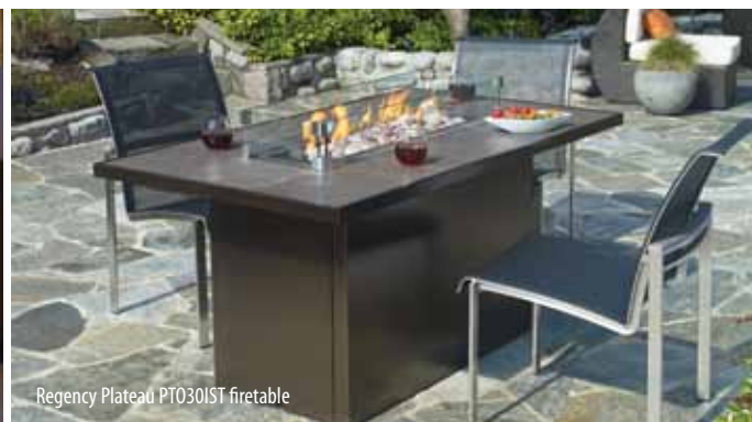
Regency Plateau PTO30IST firetable