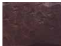
Distressed Black Copper