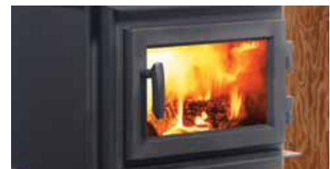
Regency Classic™ contemporary door

The new pedestal will replace the existing pedestal on all the Regency Classic Wood Stoves.