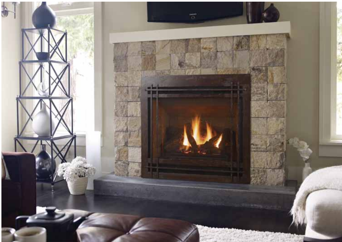
Regency Bellavista® B36XTE with the Artisan front in a Distressed Black Copper finish