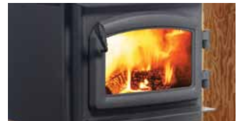
Regency Classic™ traditional door

Introducing the all new contemporary door option for Regency's classic line of wood stoves! Sleek, simple and clean; with Alterra style handle and black air control spring handle – it brings a modern appeal to the classic stove. Reach more consumers with more flexibility in design choices – choose from a traditional or contemporary door package.