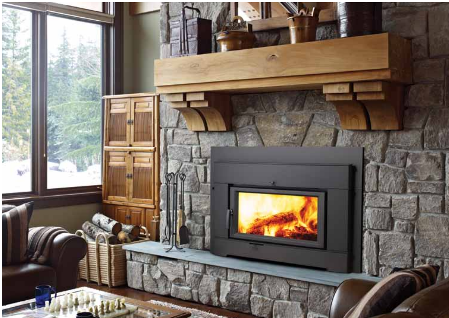
Regency CI2600 shown with contemporary faceplate and optional backing plate